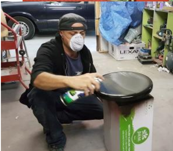
J working on the seat