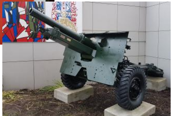
The finished article